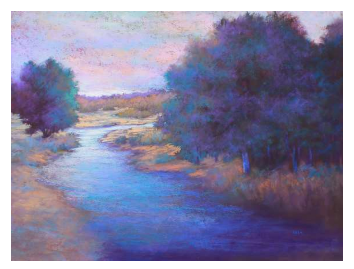
Beyond The Bend

Have you noticed that all three paintings are variations of the same scene? Plan on painting variations of the same scene; it is one of the quickest ways to learn new techniques and to experiment with expression. Using a single photograph, we will create various paintings representing different seasons and times of day.